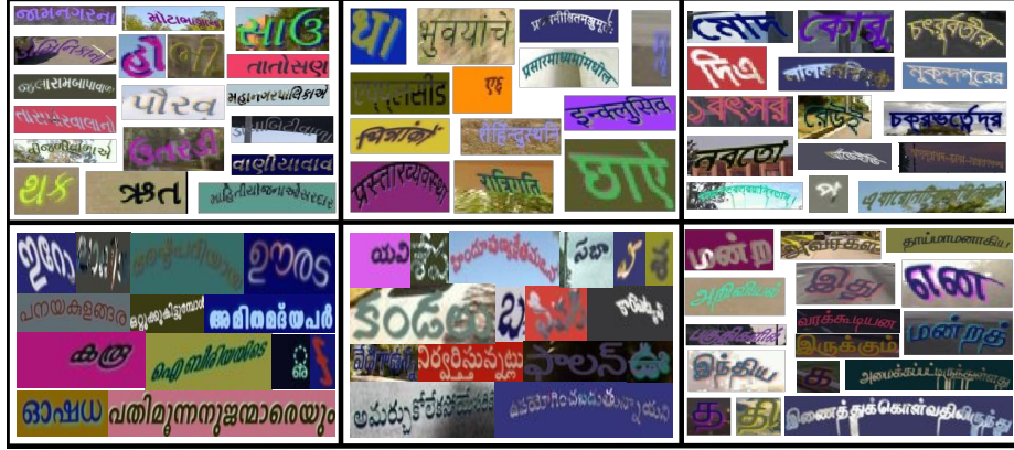
Fig. 2: Clockwise from top-left: synthetic word images in Gujarati, Hindi, Bangla, Tamil, Telugu, & Malayalam. Notice that a top-connector line connects the characters to form a word in Hindi or Bangla. Some vowels and characters appear above and below the generic characters in Indian languages, unlike English.

choose Hindi, as Hindi characters are similar to Gujarati characters and the average word length of Hindi is higher than Gujarati. Bangla has comparable word length statistics with Hindi and shares the property of the top-connector line with Hindi. Still, we keep it after Hindi in the list as its characters are visually dissimilar and more complicated than Gujarati and Hindi. We use less than 100 for fonts in Hindi, Bangla, and Telugu. We list Tamil after Bangla because these languages share similar vowels’ appearance (see the glyphs above general characters in Fig. 2). Tamil and Malayalam have the highest variability in word length and visual complexity compared to other languages. Please note that we have over 150 fonts available in Tamil.