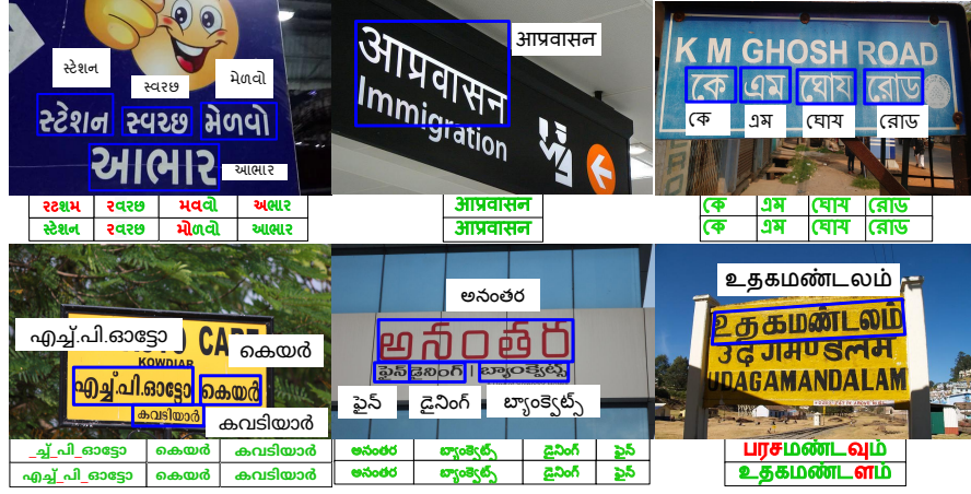
Fig. 1: Clockwise from top-left; “ Top: Annotated Scene-text images, Bottom: Baselines’ predictions (row-1) and Transfer Learning models’ predictions (row-2)”, from Gujarati, Hindi, Bangla, Tamil, Telugu and Malayalam. Green, red, and “_” represent correct predictions, errors, and missing characters, respectively.

variety of computer vision tasks and has enjoyed significant success in several commercial applications [9]. Photo-OCR has diverse applications like helping the visually impaired, data mining of street-view-like images for information used in map services, and geographic information systems [2]. Scene-text recognition conventionally involves two steps; i) Text detection and ii) Text recognition. Text detection typically consists of detecting bounding boxes of word images [4]. The text recognition stage involves reading cropped text images obtained from the text detection stage or from the bounding box annotations [13]. In this work, we focus on the task of text recognition.