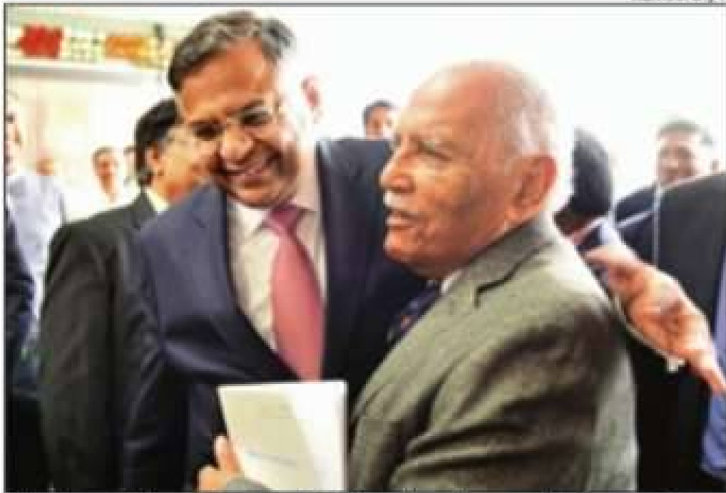
Tata Sons chairman-designate N Chandrasekaran with former TCS chief FC Kohli at the inauguration of the Kohli Center on Intelligent Systems (KCIS) at IIIT Hyderabad Campus on Monday