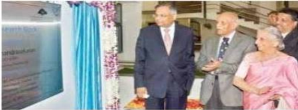
(From left) N Chandrasekaran, Chairman-designate, Tata Sons, inaugurating F C Kohli Research block in IIT-Hyderabad campus on Monday. F C Kohli, former deputy chairman of Tata Consultancy Services, also seen.