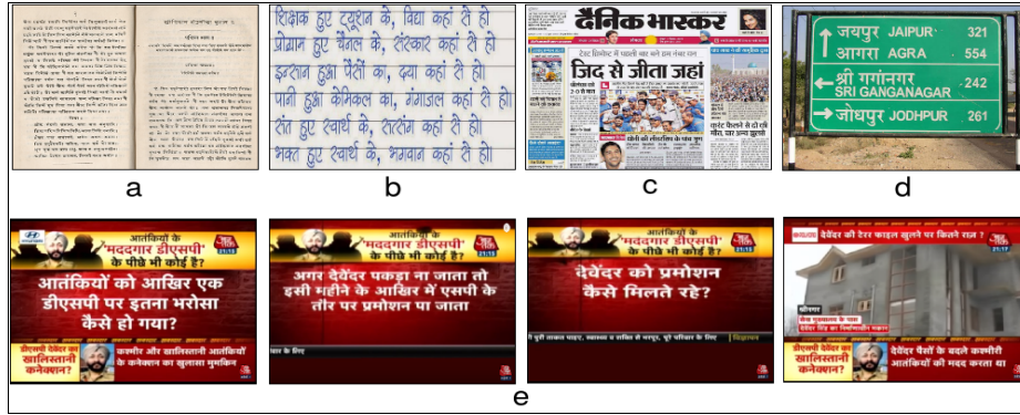
Fig. 2: A visual illustration of different modalities of text in Hindi language — (a) printed text, (b) handwritten text, (c) newspaper, (d) scene text and (e) text in few frames of a video.