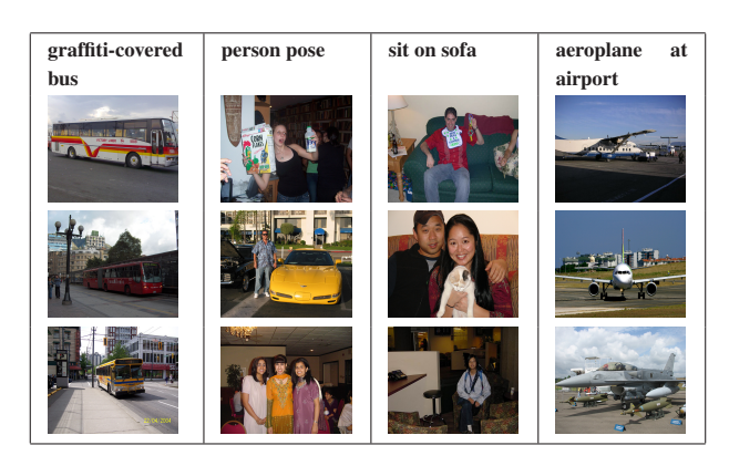
Figure 6: Images annotated with four phrases: (i) "graffiticovered bus" ( attribute_1, subject_1 ), (ii) "person pose" ( subject_1, verb ), (iii) "sit on sofa" ( verb, prep, object_2 ), and (iv) "aeroplane at airport" ( subject_1, prep, object_2 ).

Figure 5: Illustration of generating multiple interesting descriptions for an example image from the Pascal dataset.