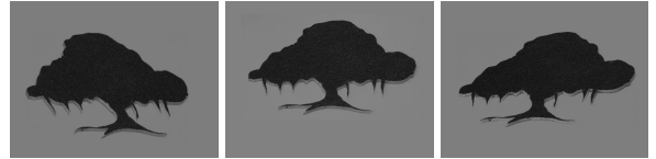
Figure 2: Three views of the logo of our institute

In the first example, we considered four views of a dinosaur as in Figure 1(a), (b), (c) and (d). These views are related by affine transformations. One may observe that the Euclidean measures are no longer preserved under these transformation. However, the rank constraints allow us to recognise a dinosaur image given another view. Ranks of \Theta and \Theta''' were computed. Ratio of the r th and (r + 1) th singular values are used to verify the ranks. All constraints provided the ratio to be much more than 100 in all cases. The ratios of singular values for each pairs of images for the invariant and magnitude constraints are arranged in Table 1. In all cases, the r th singular value ( r = 1 for \Theta and r = 3 for \Theta''' ) was found to be greater than the (r + 1) th one by a factor of 100 or 1000.