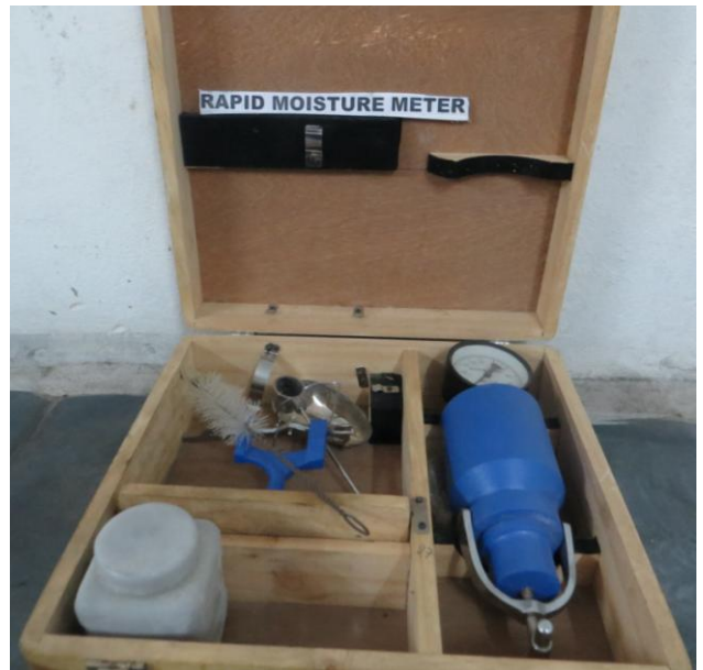
RAPID MOISTURE METER